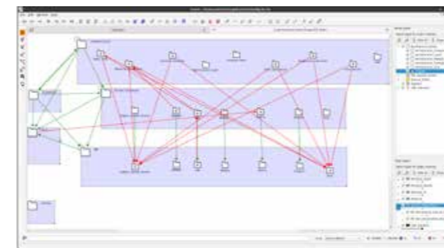
Validate or even reconstruct your architecture

SGS-TÜV Saar GmbH has certified that Axivion Static Code Analysis is suitable for use in the development of safety systems up to the highest level of the safety requirement contained in the respective standard: ISO 26262 up to ASIL D, IEC 61508 up to SIL 4, IEC 62304 up to Class C and EN 50657 up to SIL 4.